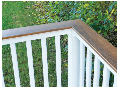
Key West Drink Rail Bracket System