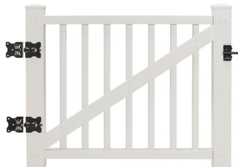
Gate with Powder-Coated Stainless-Steel Hardware