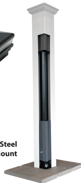
The Patriot Steel Post Mount